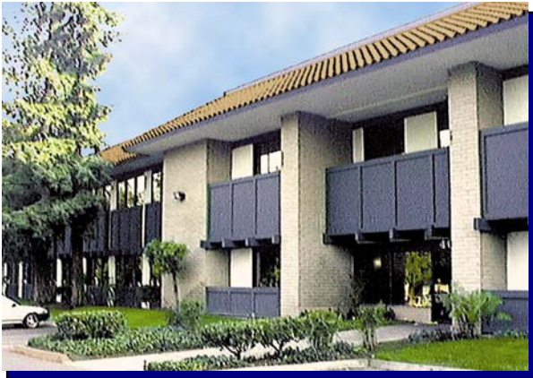
4030 Moorpark Avenue, San Jose

Computer Magic Training is well-known for our fantastic trainers and comfortable training environments ... the best classes in the industry!