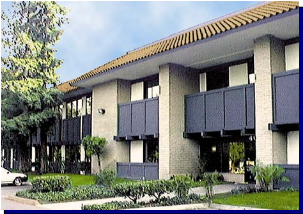
4030 Moorpark Avenue, San Jose

Computer Magic Training is well-known for our fantastic trainers and comfortable training environments ... the best classes in the industry!