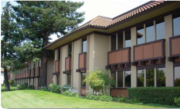
4030 Moorpark Avenue, San Jose

Computer Magic Training is well-known for our fantastic trainers and comfortable training environments ... the best classes in the industry!